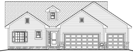
F - TRADITIONAL